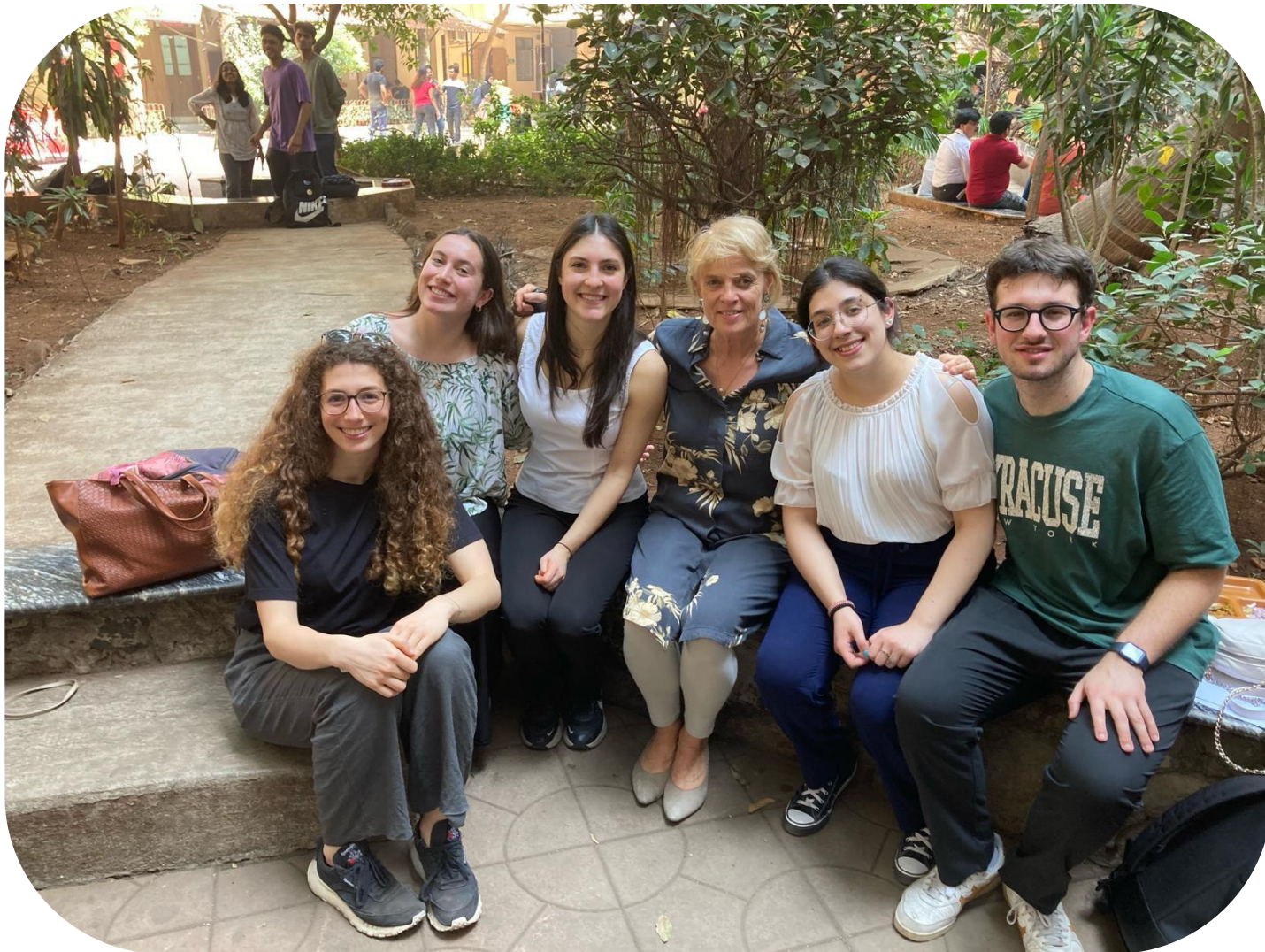
Bergamo team at St. Xavier's College, Mumbai